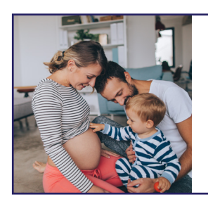
To support all babies in Norfolk to start life with breast milk.

Grants will be successful when they are directly in line to help reach Family Hub and Start for Life outcomes detailed below: